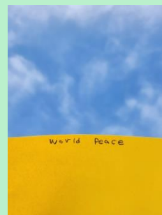
Intermediate (3-5) Honorable Mention Isabella Lee, Grade 5